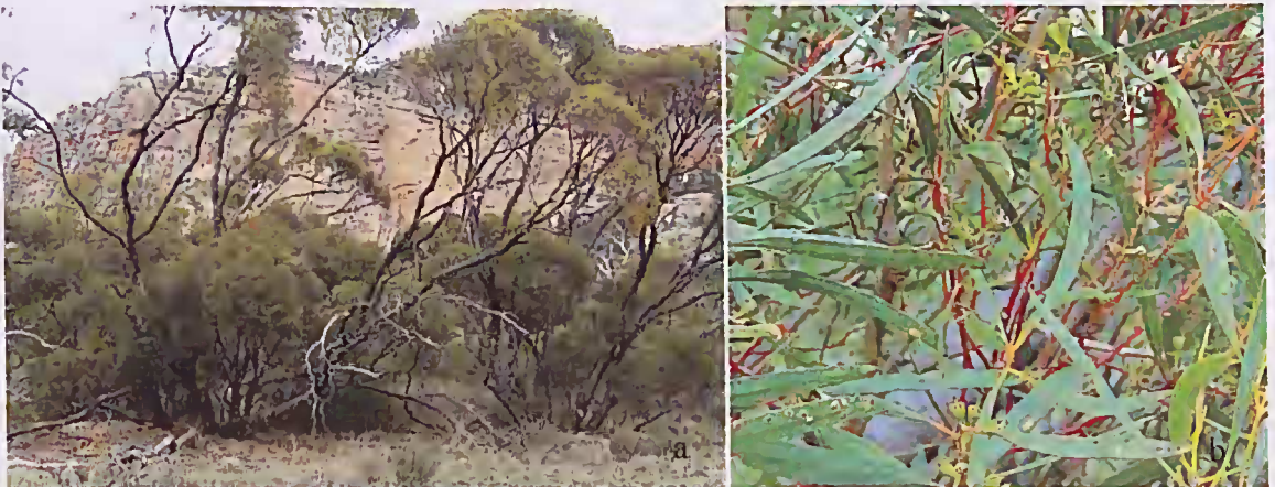
Figure 3: Eucalyptus wimmerensis subsp. arapilensis , NE of Mt Arapiles. a. mallee form; b. foliage.

Notes: Eucalyptus wimmerensis subsp. arapilensis differs from the typical subspecies by its substantial stocking of persistent box-like bark, its narrower juvenile